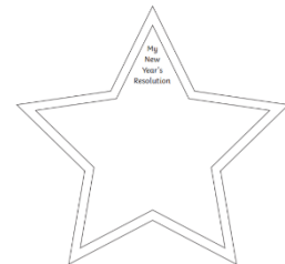
New Year's Resolution Stars

Write about your resolution in a star (either printed from online resources or draw one) and draw a picture to go with it.