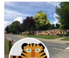
Attleborough Primary @AttleboroughPri